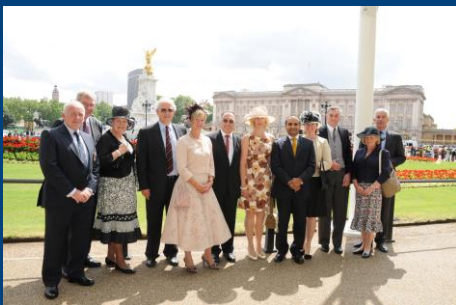
Employers at previous Royal Garden Party

Three employers from Chesterfield, Derby and Matlock have been invited to attend a Royal Garden Party this May, after demonstrating their support for the Reserve Forces.