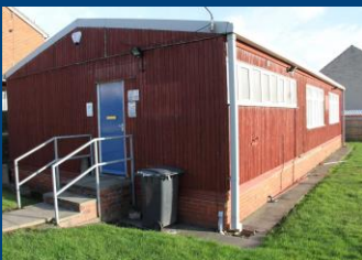
Former training hut in Dronfield

"1890 (Dronfield) Squadron ATC's former training hut has now been demolished and work is progressing for a summer 2015 finish."